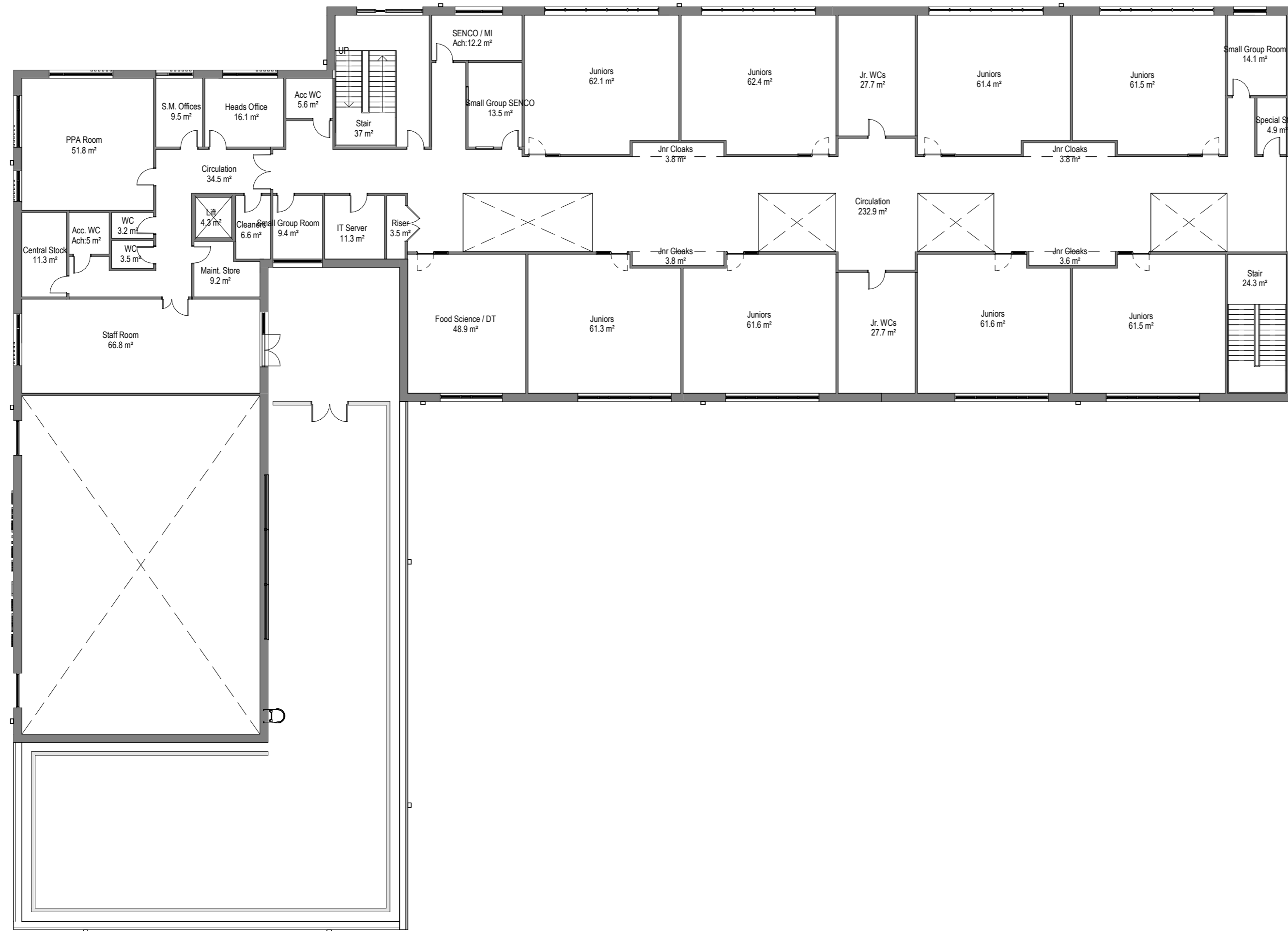
PROPOSED FIRST FLOOR PLAN 1 : 200