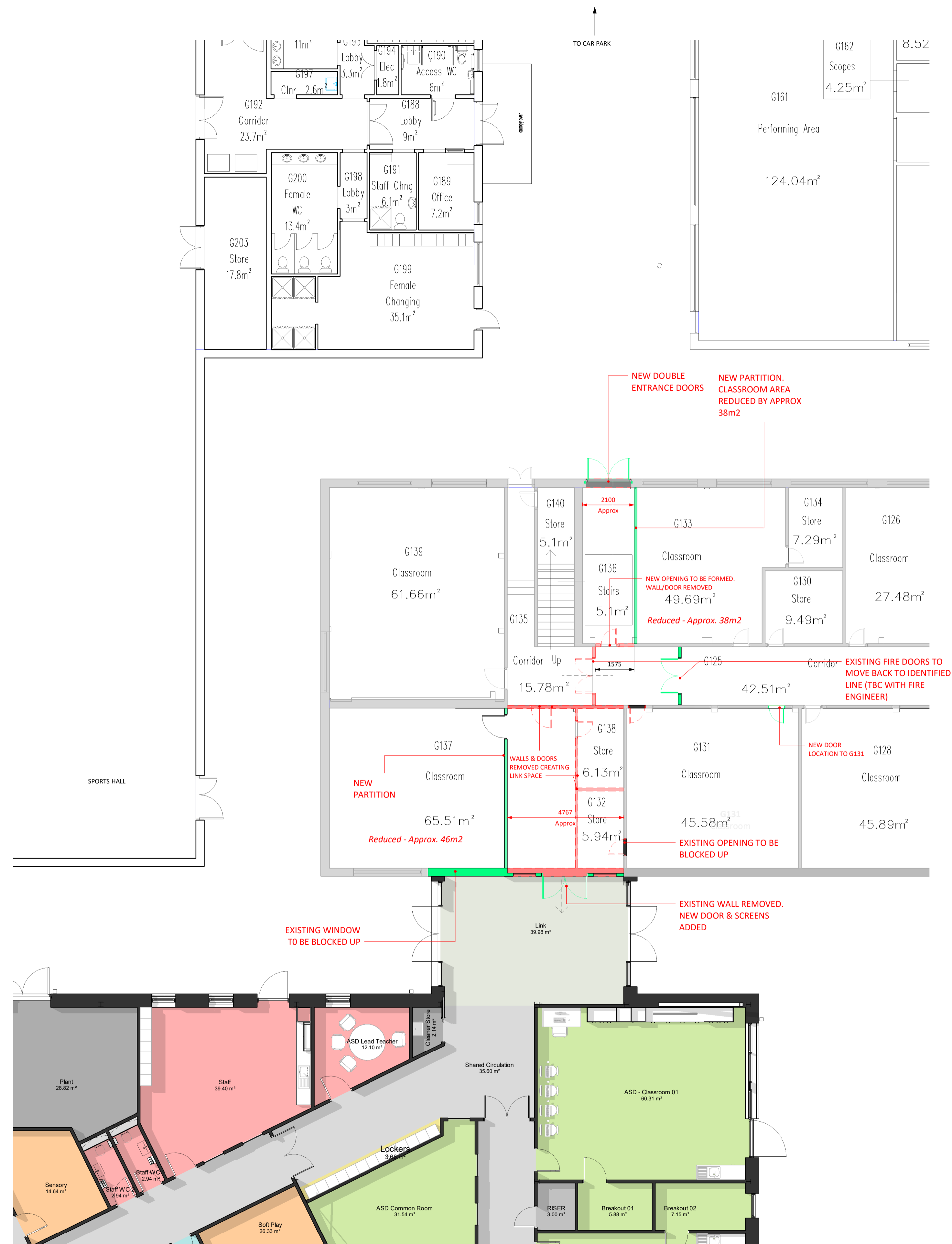
PROPOSED CONNECTION TO EXISTING SCHOOL