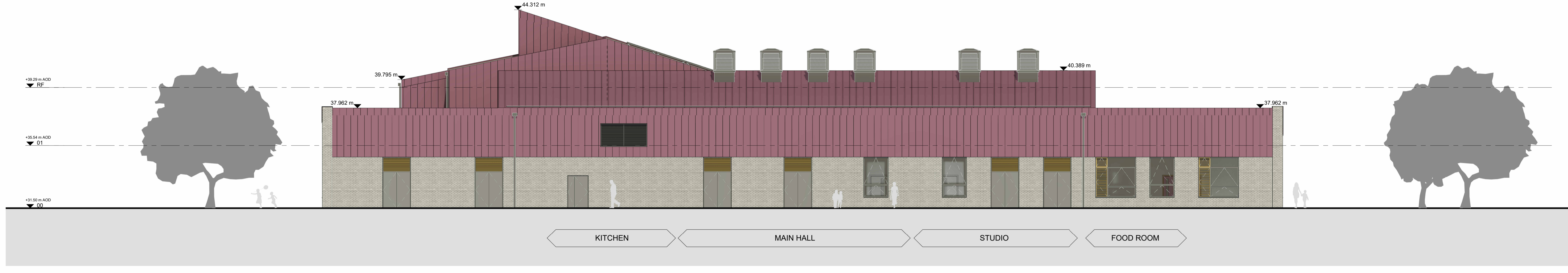
North Elevation 2 1 : 100