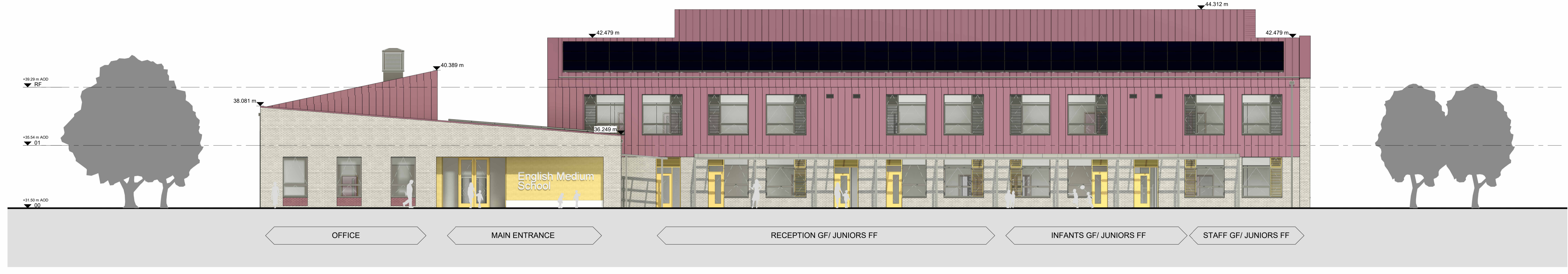
South Elevation 2 1 : 100