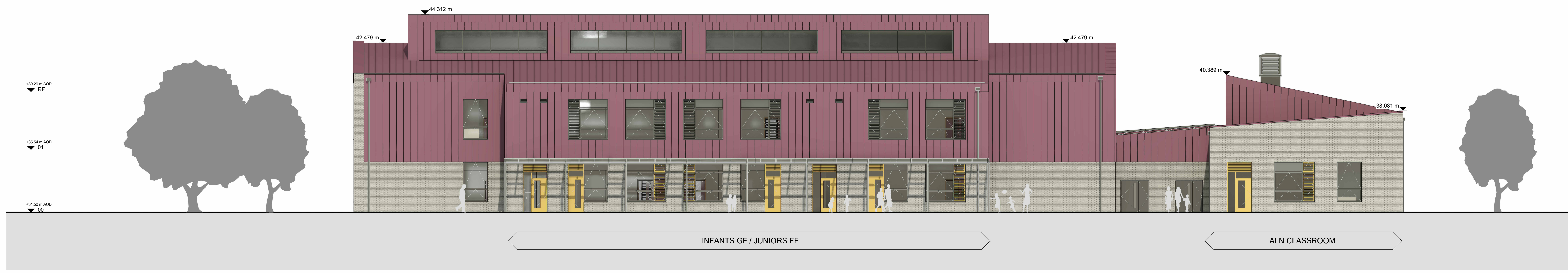
West Elevation 2 1 : 100