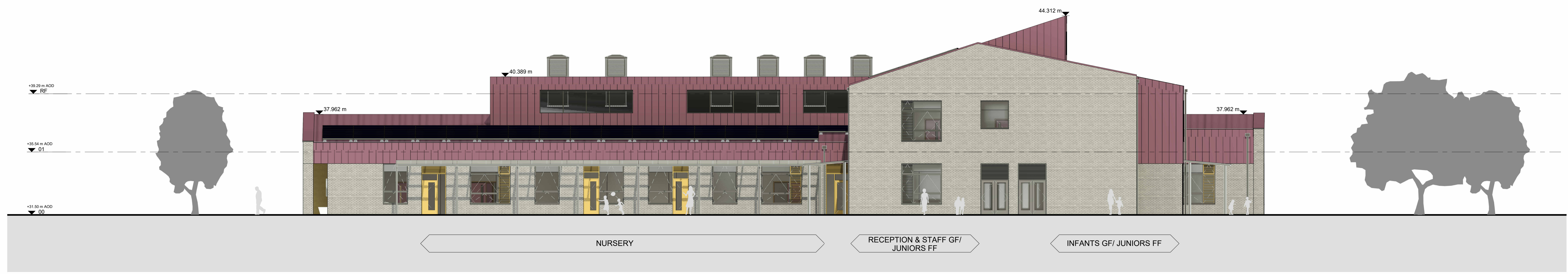
East Elevation 2 1 : 100

Note: For high-level window and louvre types, please refer to drawings: BR0201-SRA-01-ZZ-SH-A-31900 BR0101-SRA-ZZ-ZZ-DR-A-31100 Colours shown are indicative and may change.