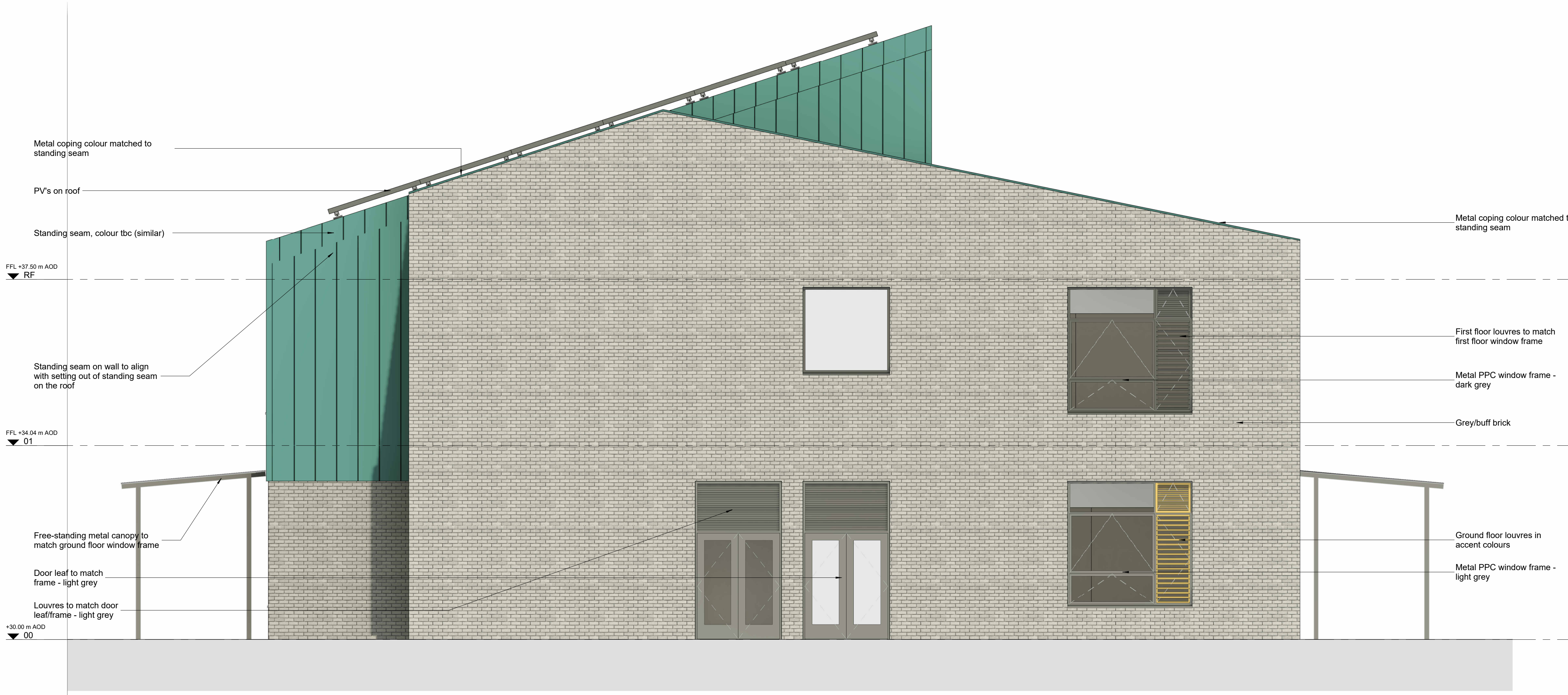
2 Teaching Wing Gable - Elevation BB 1 1 : 50