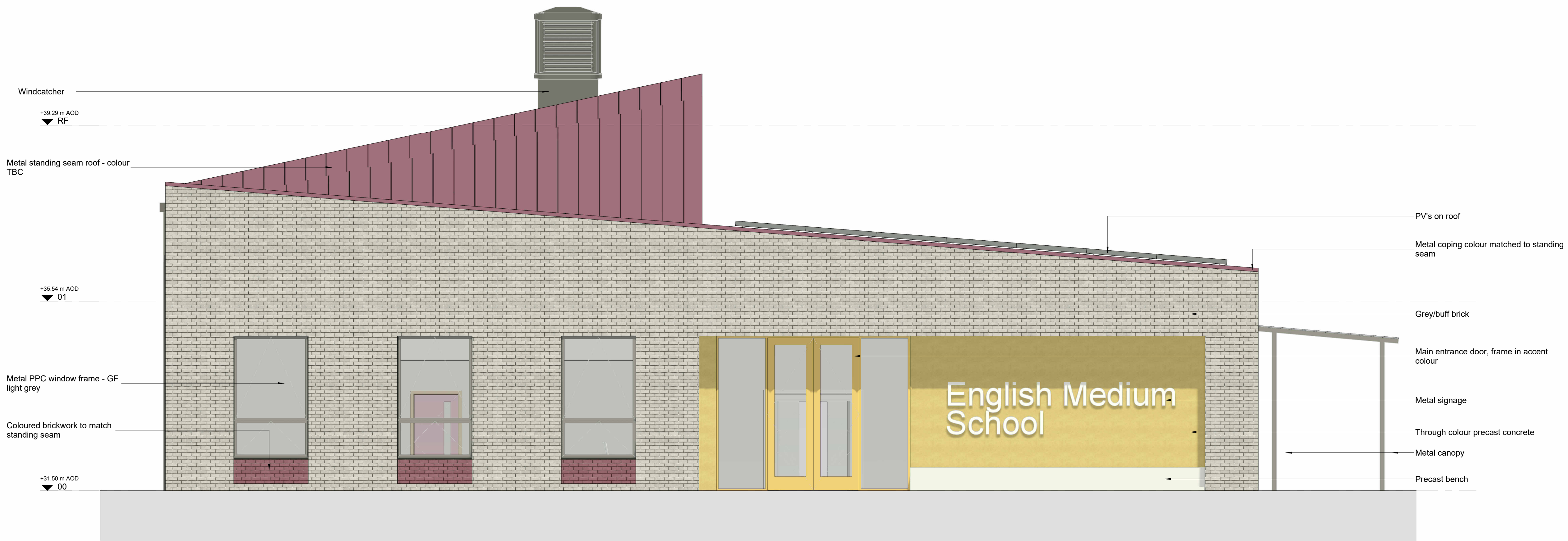
1 Main Entrance - Elevation AA 02201 1 : 50

FOR ELECTRONIC DATA ISSUE Electronic Data / drawings are issued as "read only" and should not be interrogated for measurement. All dimensions and levels should read, only from those values stated in text on the drawing.