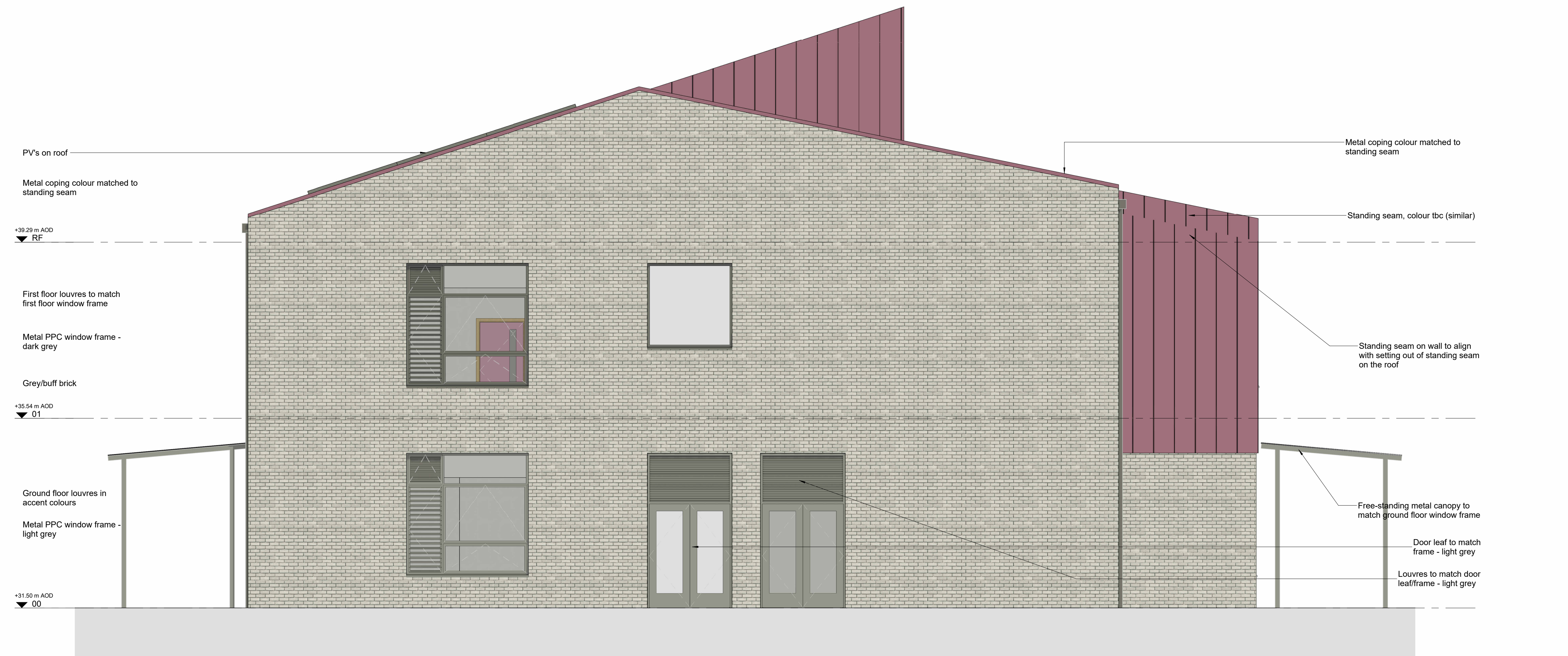
2 Teaching Wing Gable - Elevation BB 02201 1 : 50