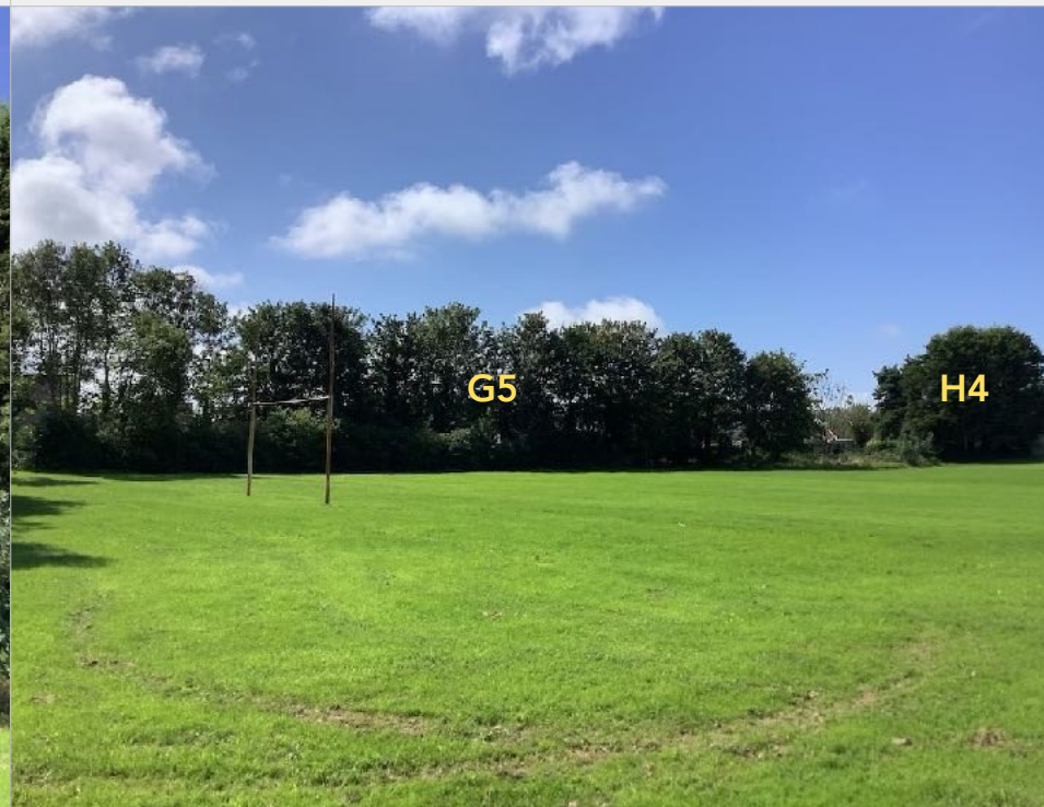
IMAGE 5: A wider view south of the boundary showing the space created by the removal of G6 & the off-site tree T22, in relation to the other features.