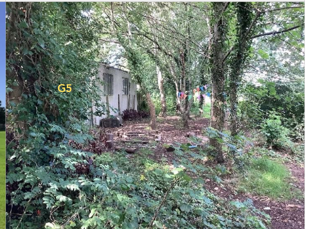
IMAGE 6: An internal view west looking within G5, showing the outdoor classroom area.