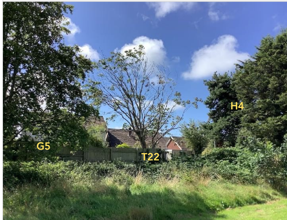
IMAGE 4: View south of the boundary showing the space created by the removal of G6 & the off-site tree T22.