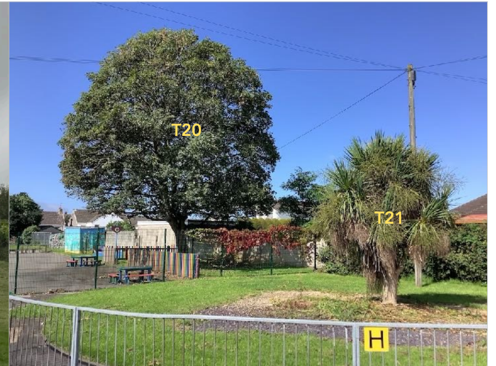
IMAGE 3: View of T20 & T21 looking south-west from the north school entrance.