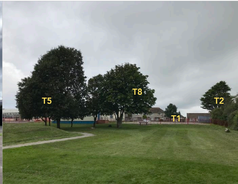
IMAGE 2: View of tree grouping T3 to T8, looking north-west, with off-site Leyland cypress to the right.