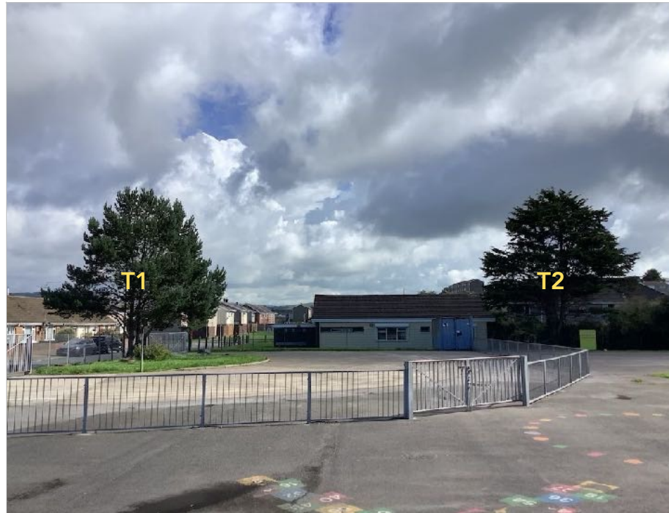
IMAGE 1: View from within the north of the site, looking east towards Greenfield Terrace, with T1 & the off-site T2 shown.