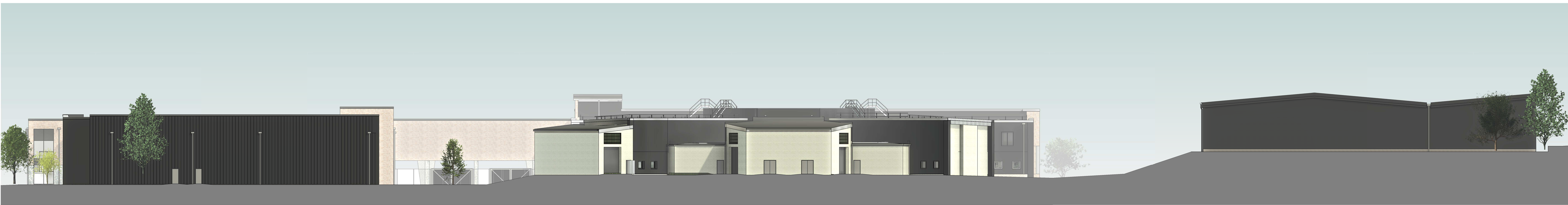
2 Elevation - Proposed - Long East Elevation 1 : 200