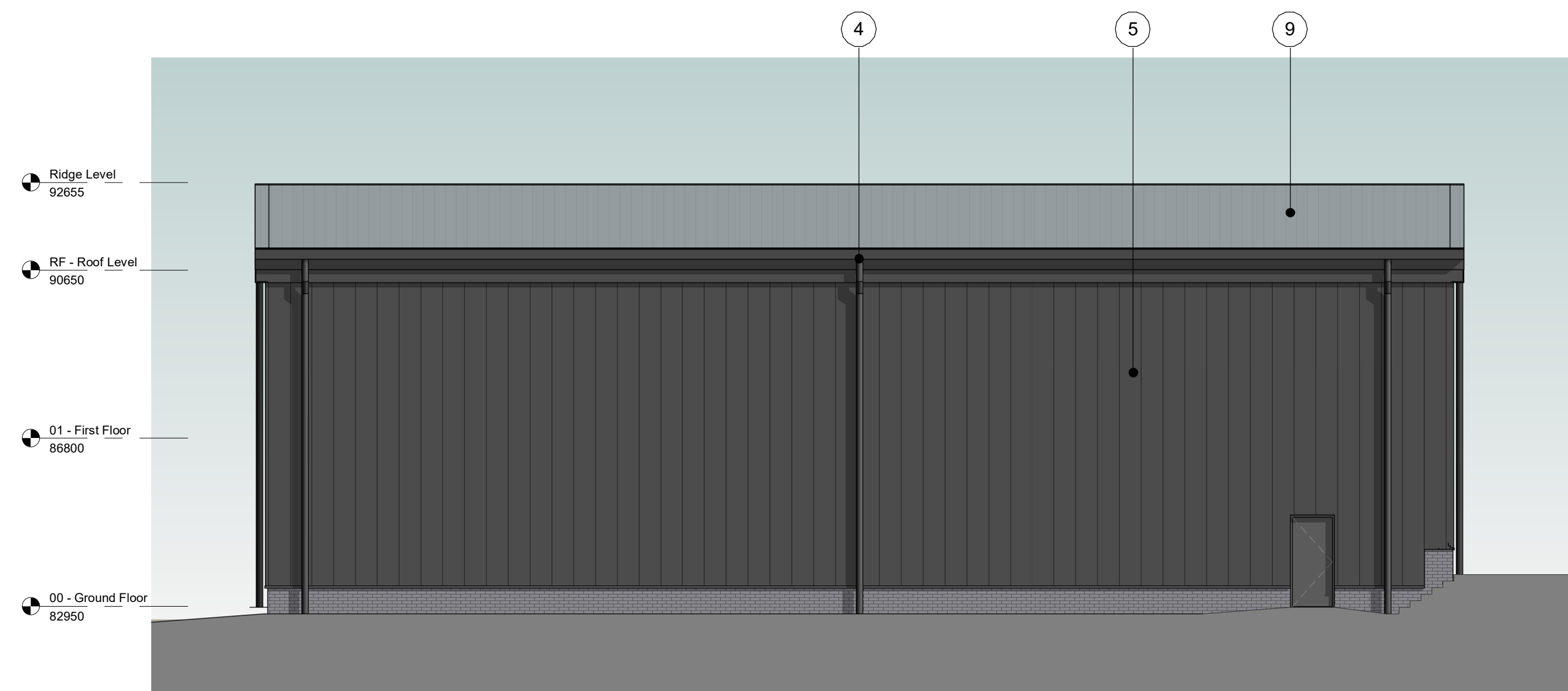
D Proposed South Elevation - D 1 : 100