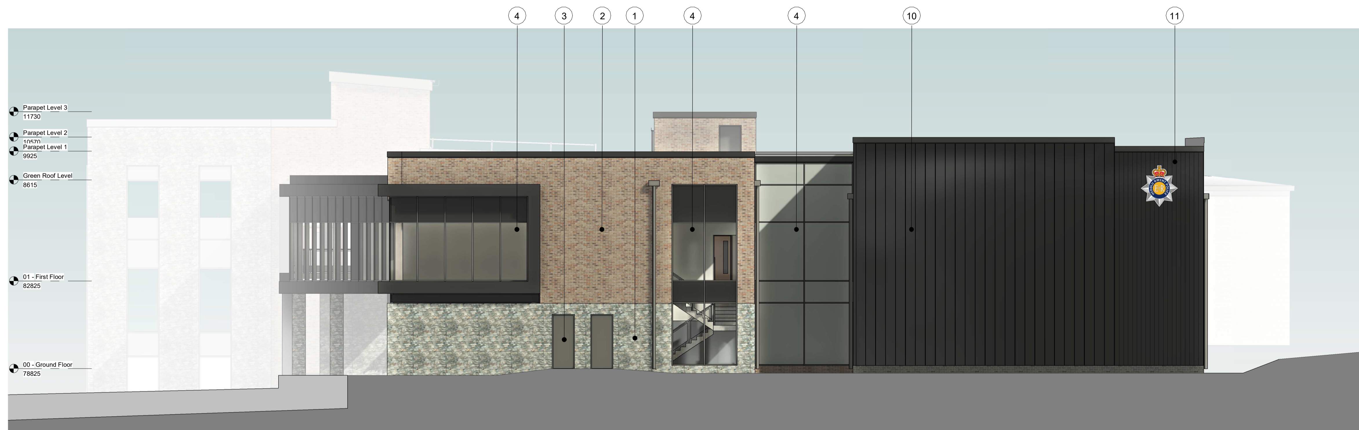
D Proposed South Elevation D 1 : 100