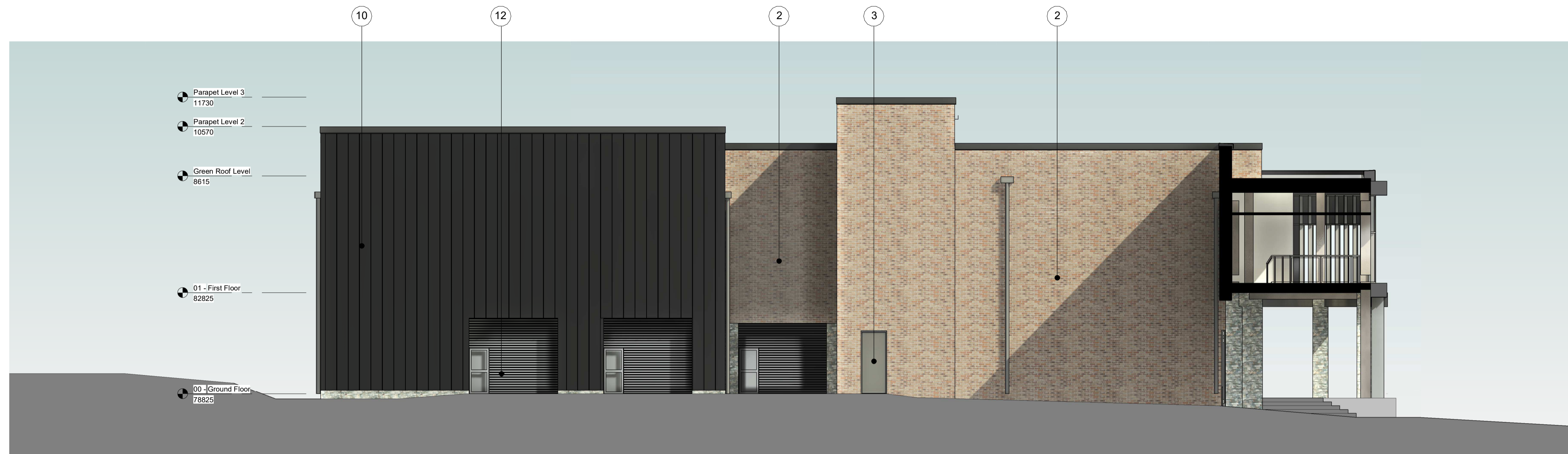
C Proposed North Elevation C 1 : 100