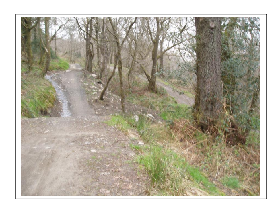
Block 4, views across the area (Contained within Craig Gethin SINC) Appendix 1