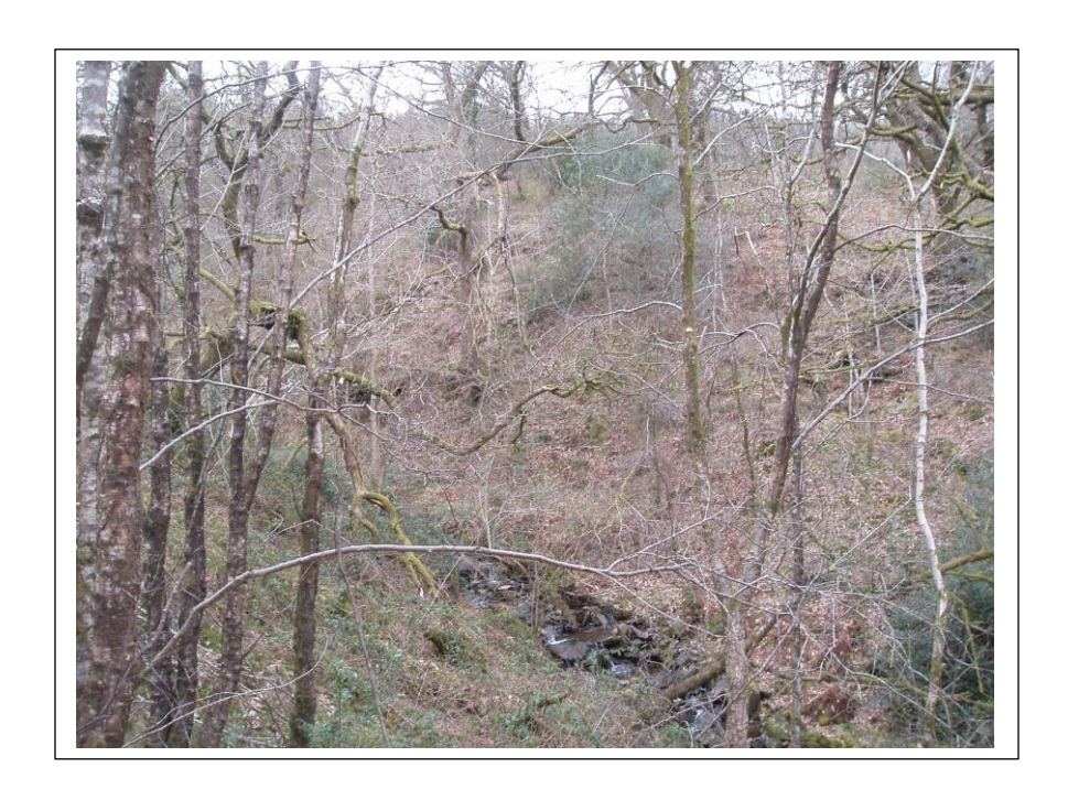
Block 4, views across the area (Contained within Craig Gethin SINC)