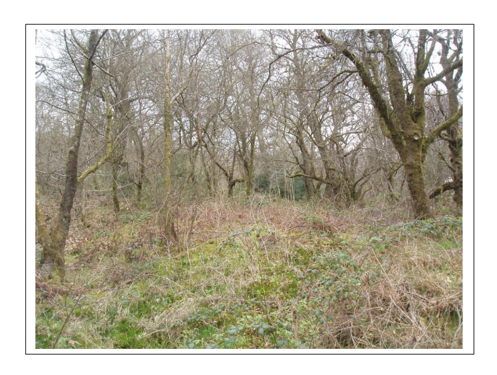
Block 4, views across the area (Contained within Craig Gethin SINC)