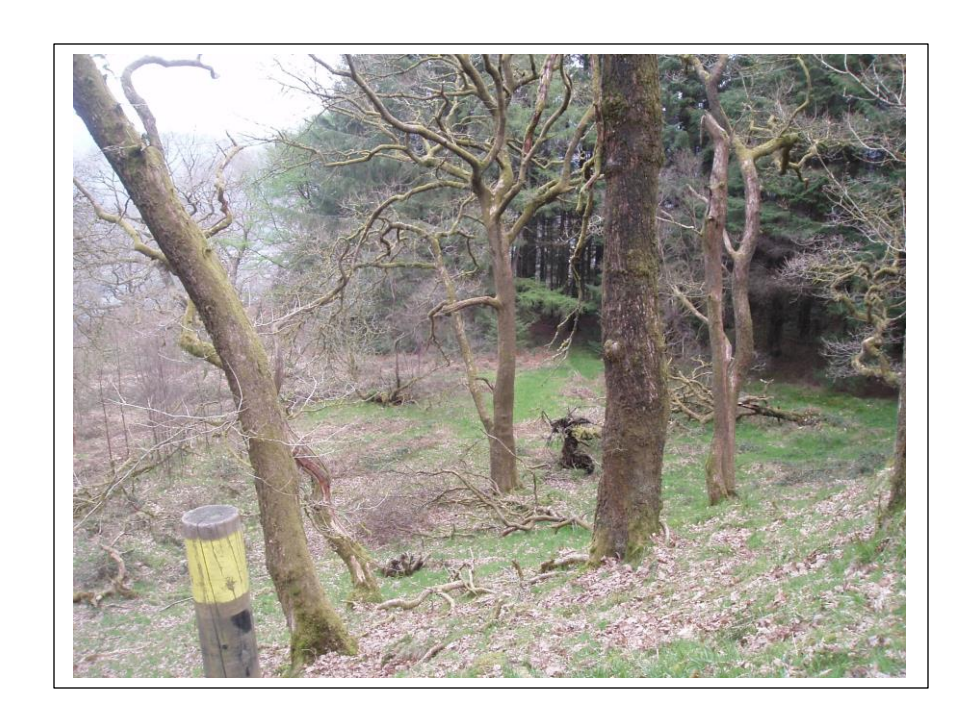
Block 4, views across the area (Contained within Craig Gethin SINC)