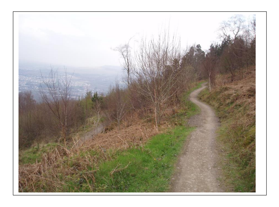
Block 1 – Cwm Woods (uphill of uplift road) Showing existing trails