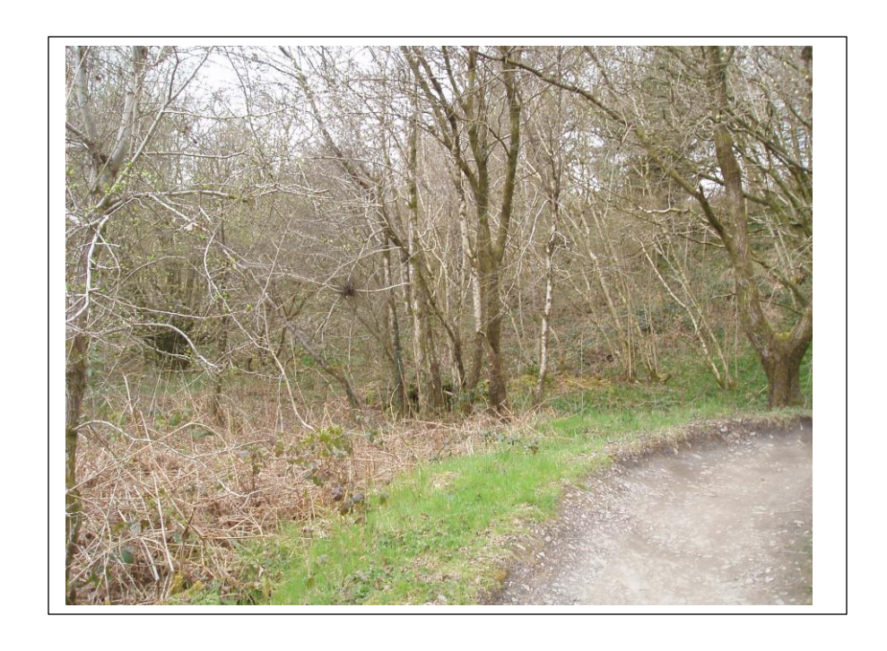
Block 2 (and RhydyCar West SINC), lower picture showing maintained edge to trail.