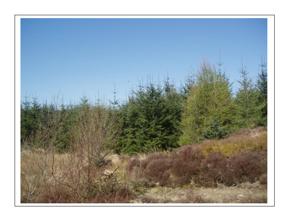
Road B showing small areas of heath along track edges