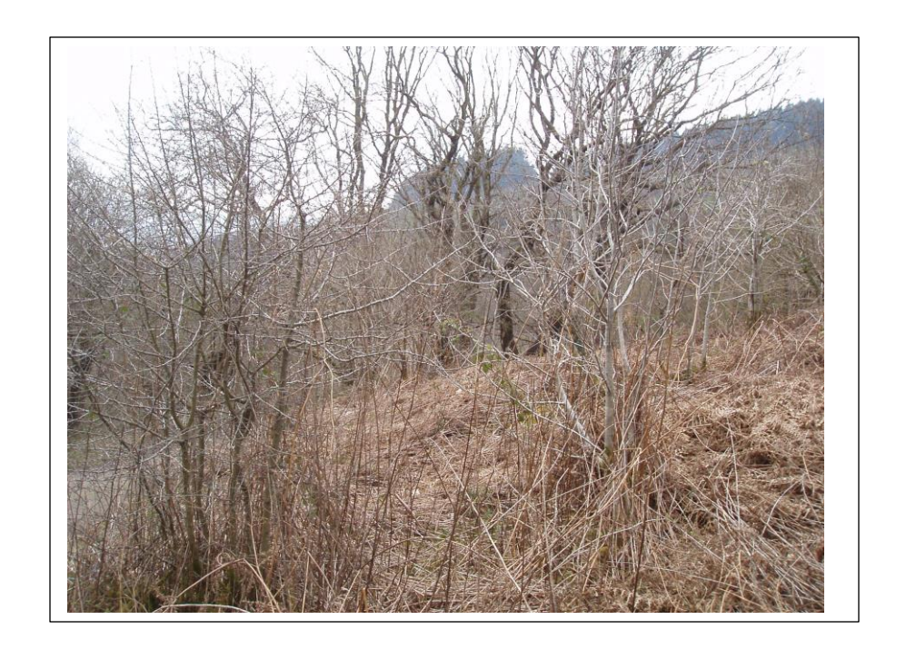
Block 2 (and RhydyCar West SINC)