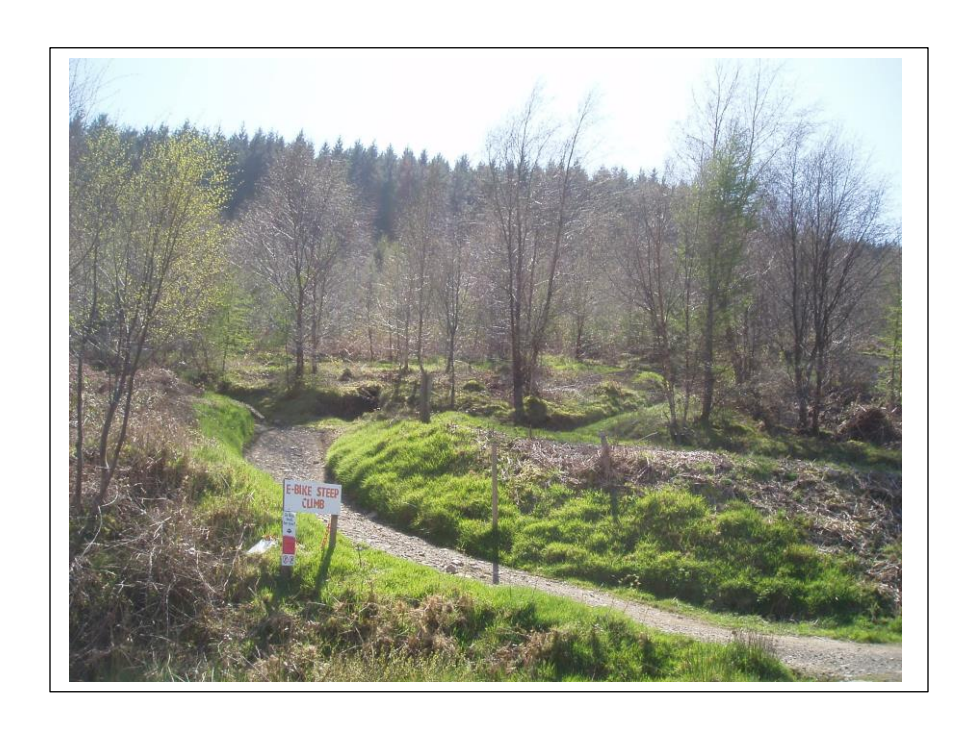
General Views of the Site