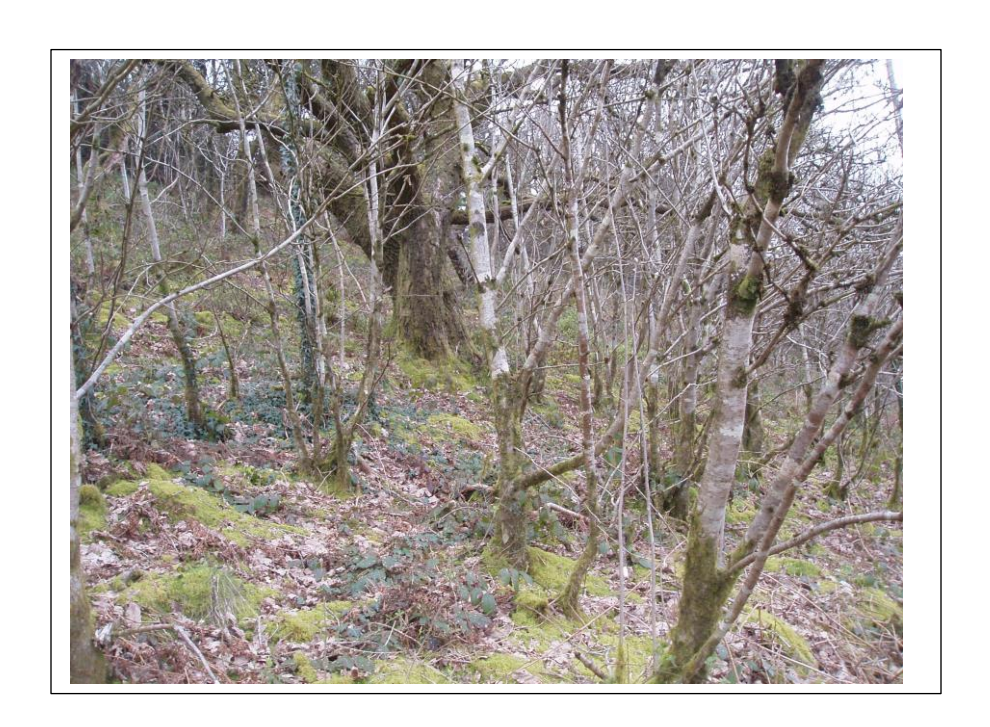
Block 1 – Cwm Woods (uphill of uplift road)