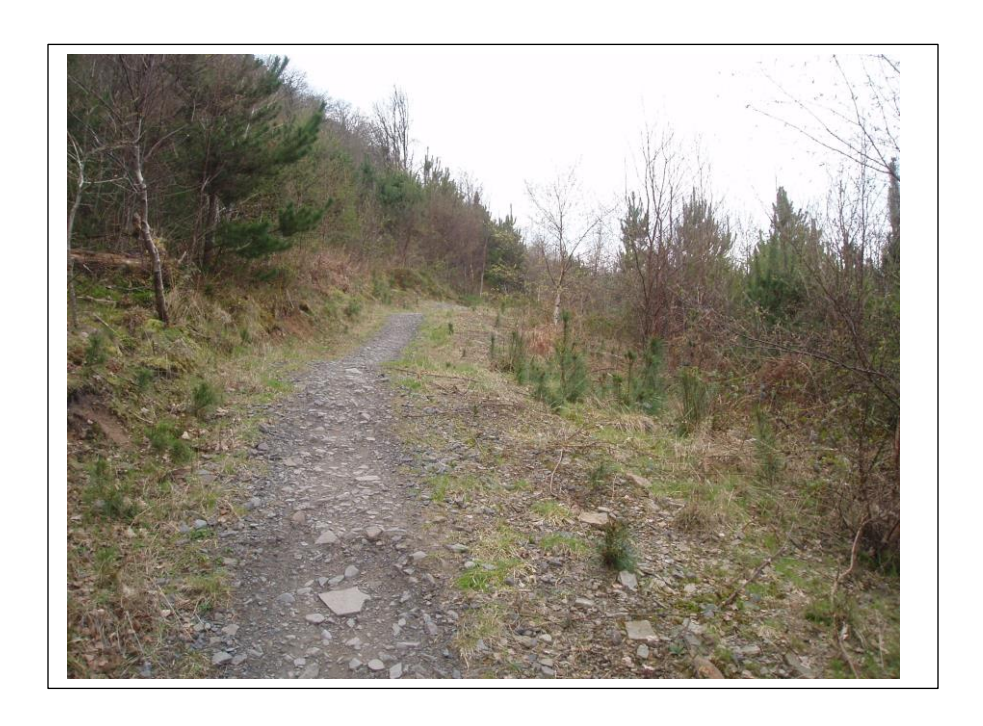
Block 1 – Cwm Woods (uphill of uplift road), bike trail in lower picture