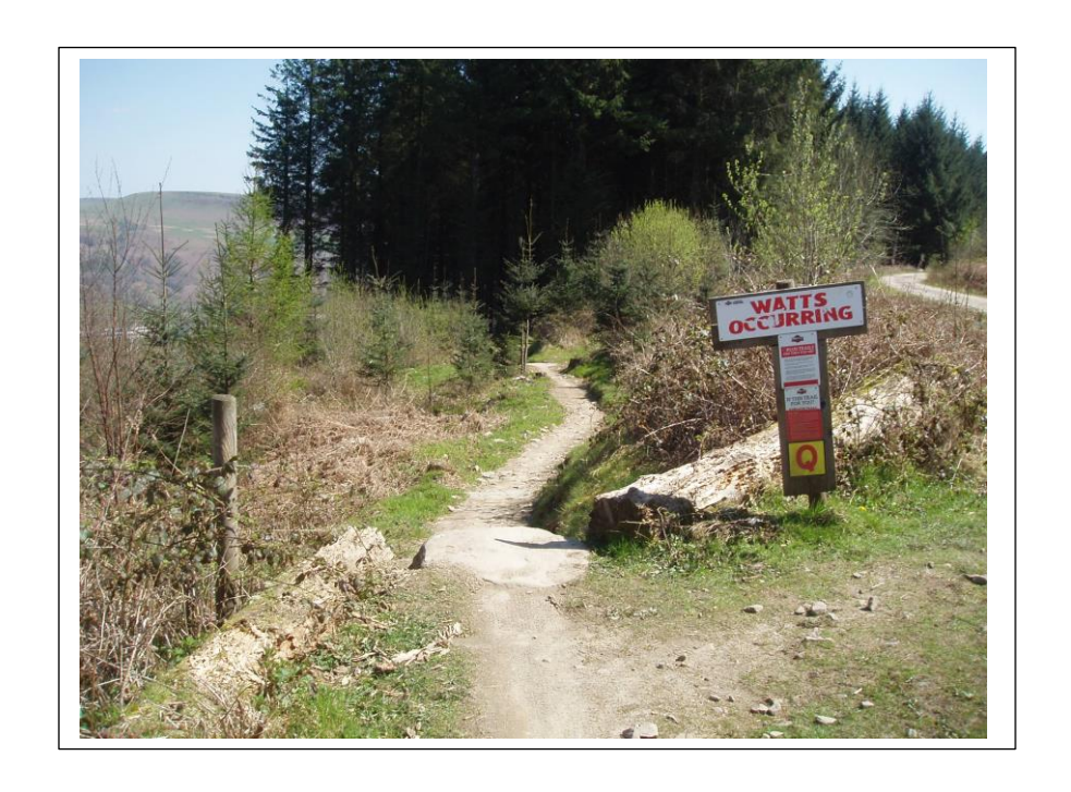
General Views of the Site