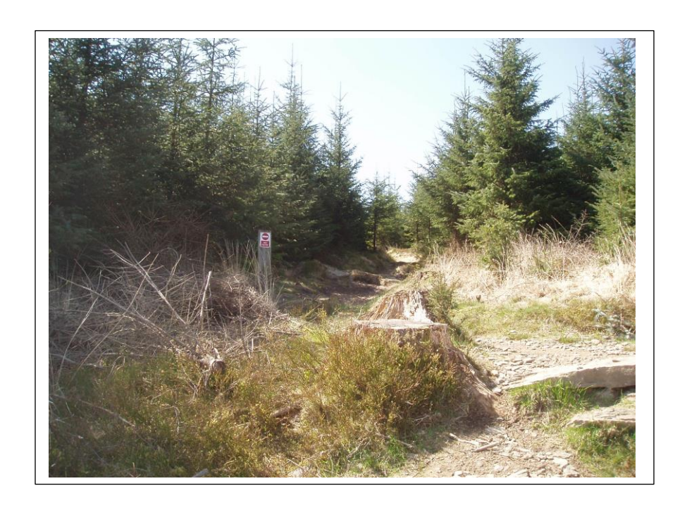
General Views of the Site