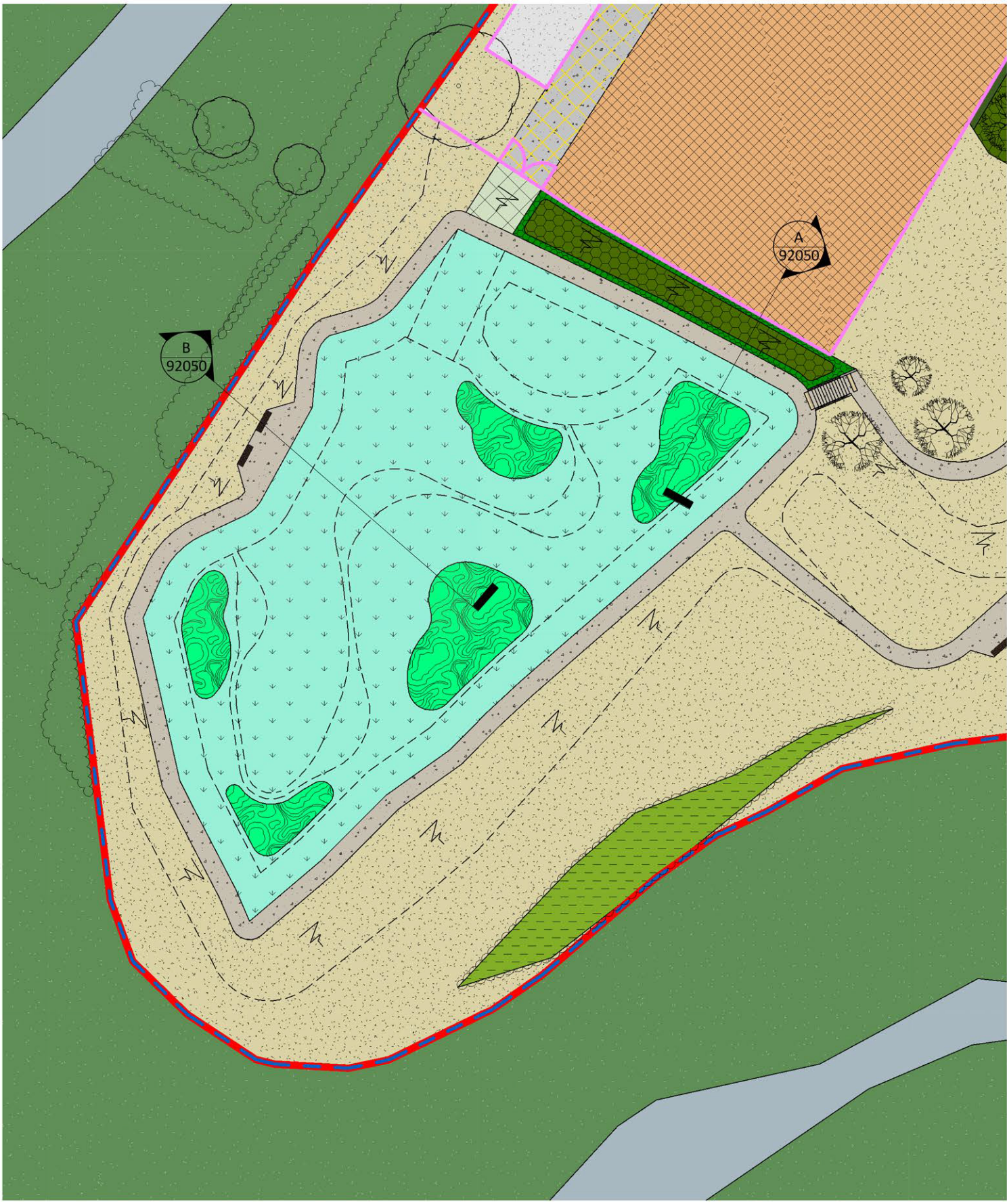
92050 Location Plan 1:500