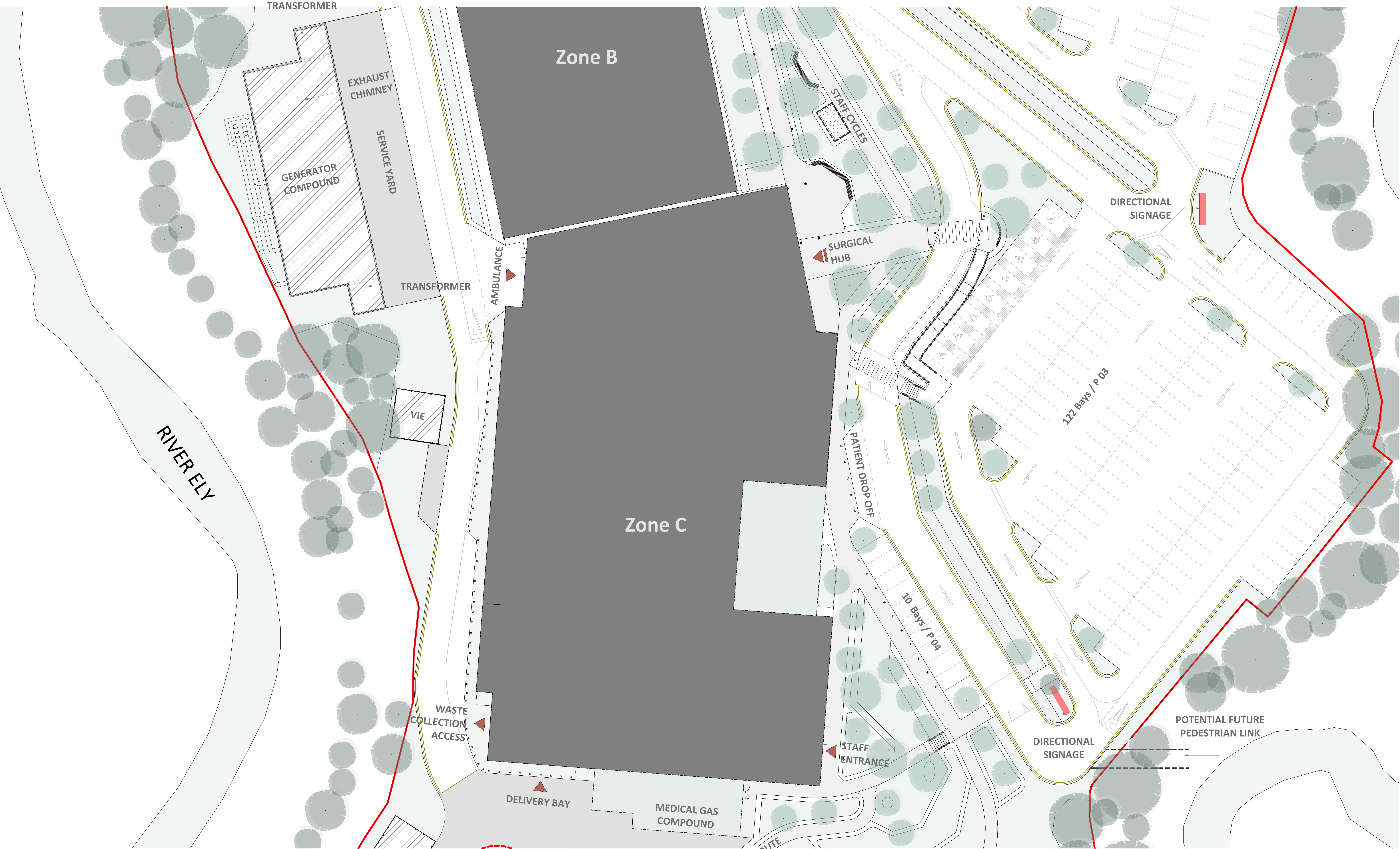
Proposed Site Plan - Part 2/3 1 : 200

Responsibility is not accepted for errors made by others in scaling from this drawing. All construction information should be taken from figured dimensions only.