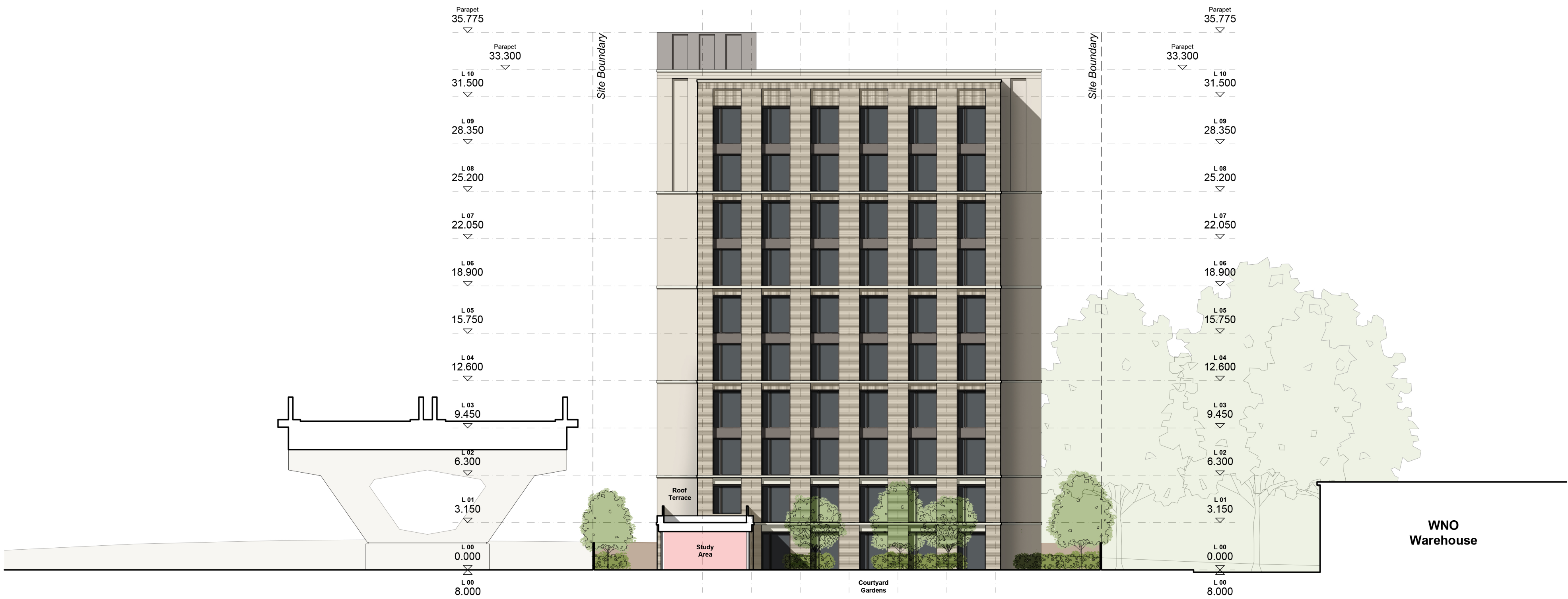
Proposed Elevation 03 - North Facing (Sectional) Scale 1:200 at A3