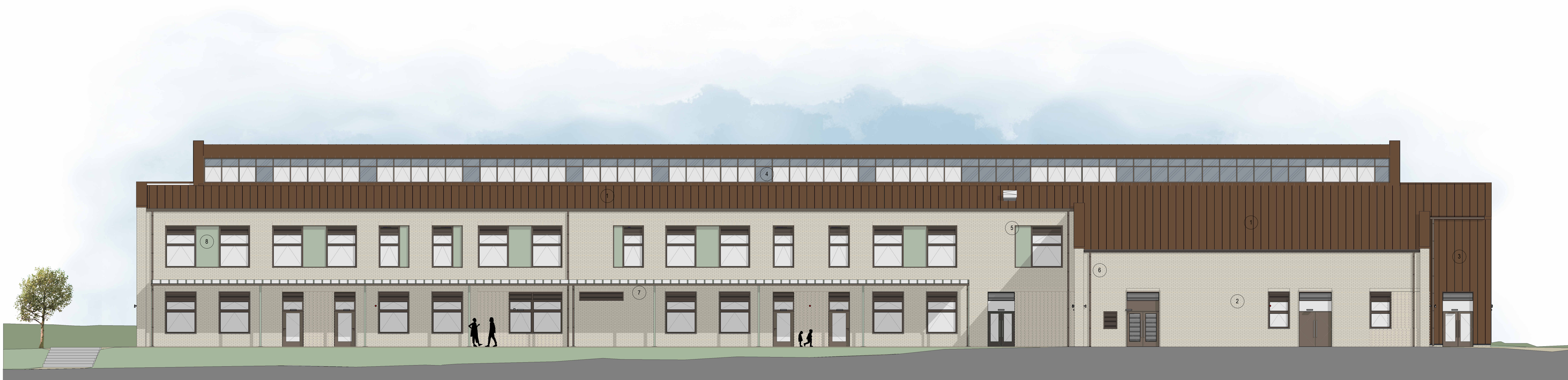
Elevation 2 - Coloured East Facade Scale: 1 : 100