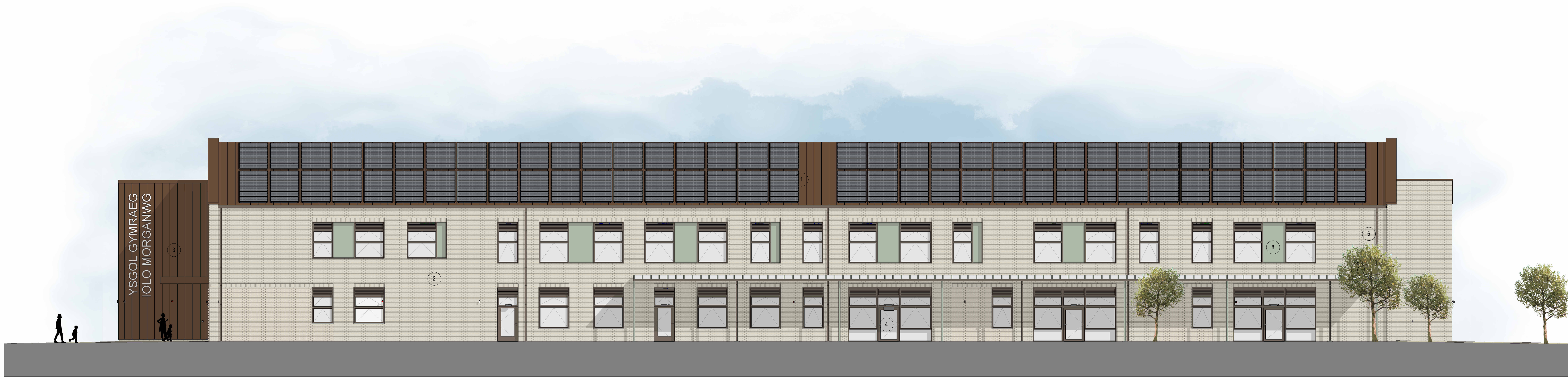
Elevation 1 - Coloured West Facade Scale: 1 : 100