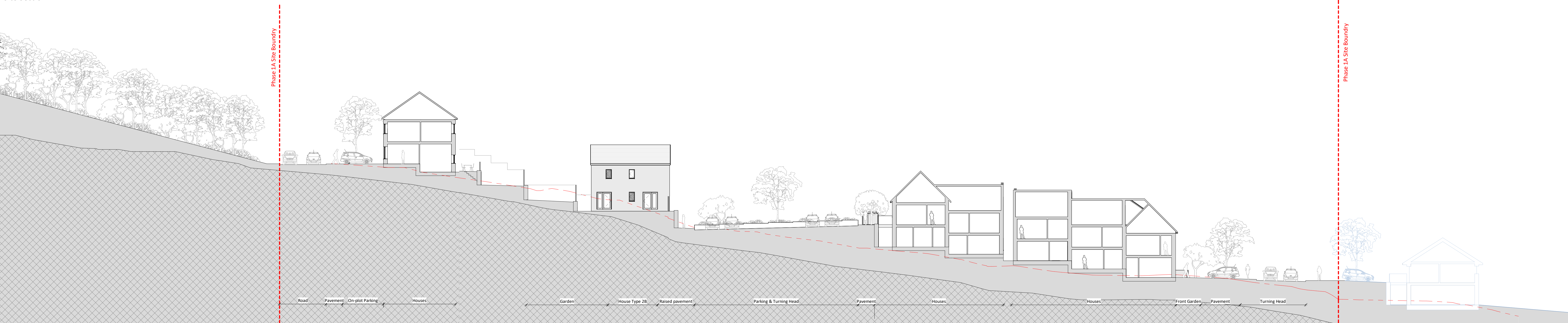
Site Section B