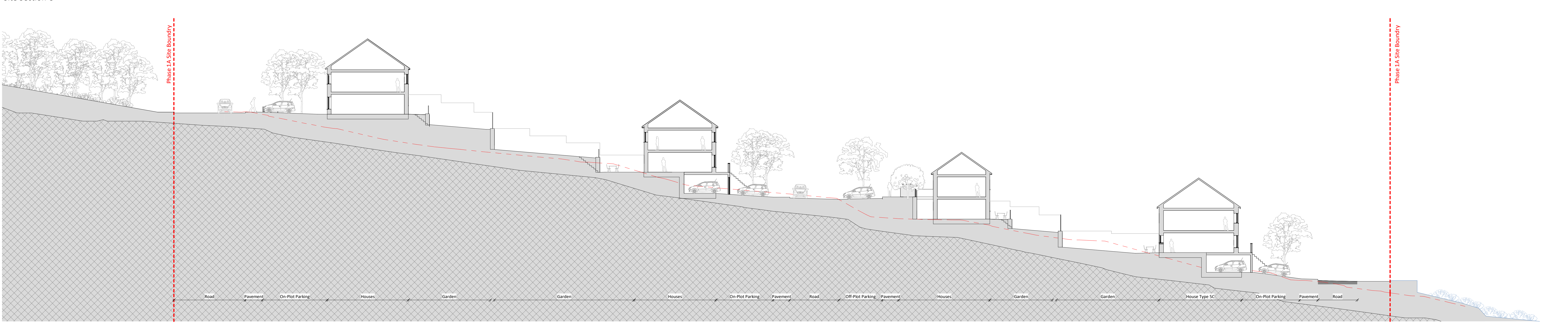
Site Section D

Responsibility is not accepted for errors made by others in scaling from this drawing. All construction information should be taken from figured dimensions only.