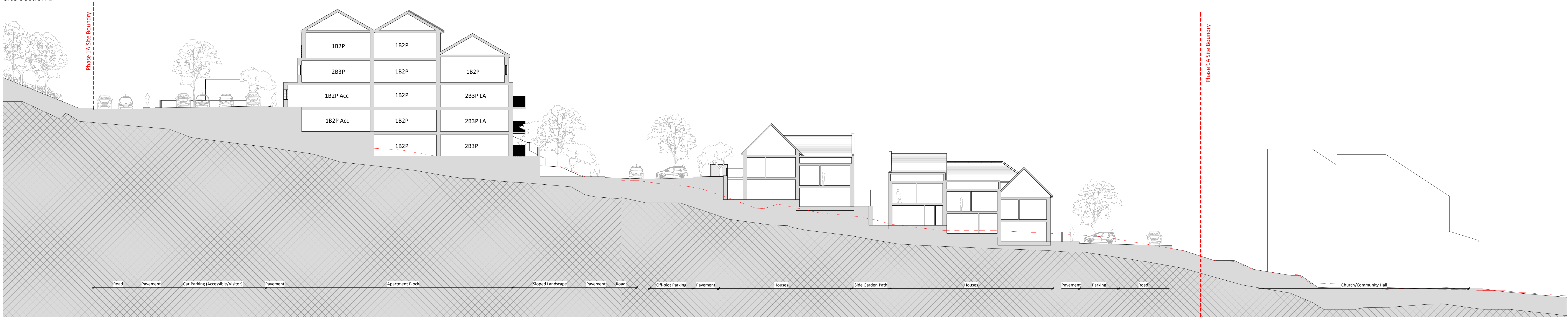
Site Section C