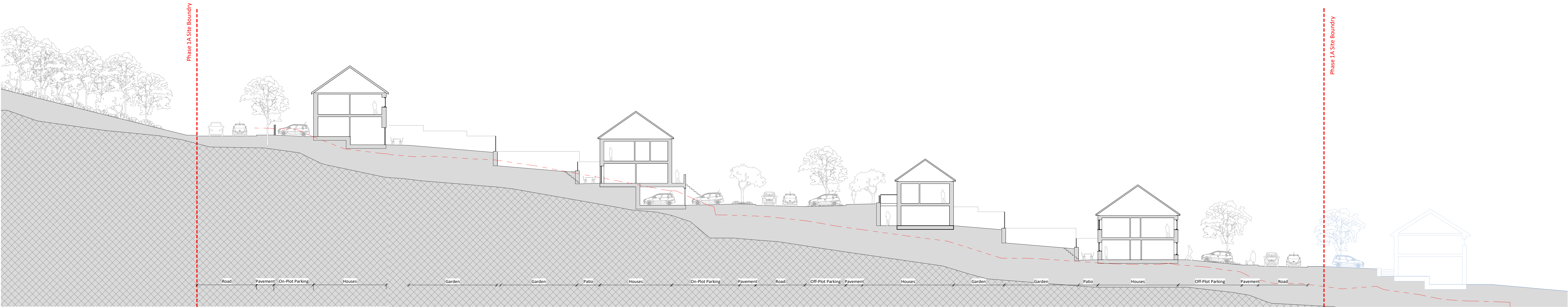
Site Section A